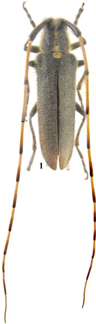
Fig. 1. Agapanthia (Epoptes) asphodeli asphodeli (Latreille, 1804): male, Caucasus, Teberda, 3.6.1924.