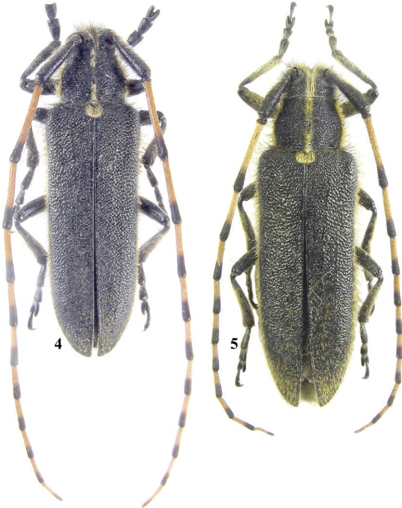
Figs 4-5. Agapanthia (Epopetes) asphodeli kastamonica ssp. n.: 4 - Holotype, male, Turkey, Kastamonu, Yaraligoz, 7.7.1997, N. Auvray; 5 - paratype, female with same label.