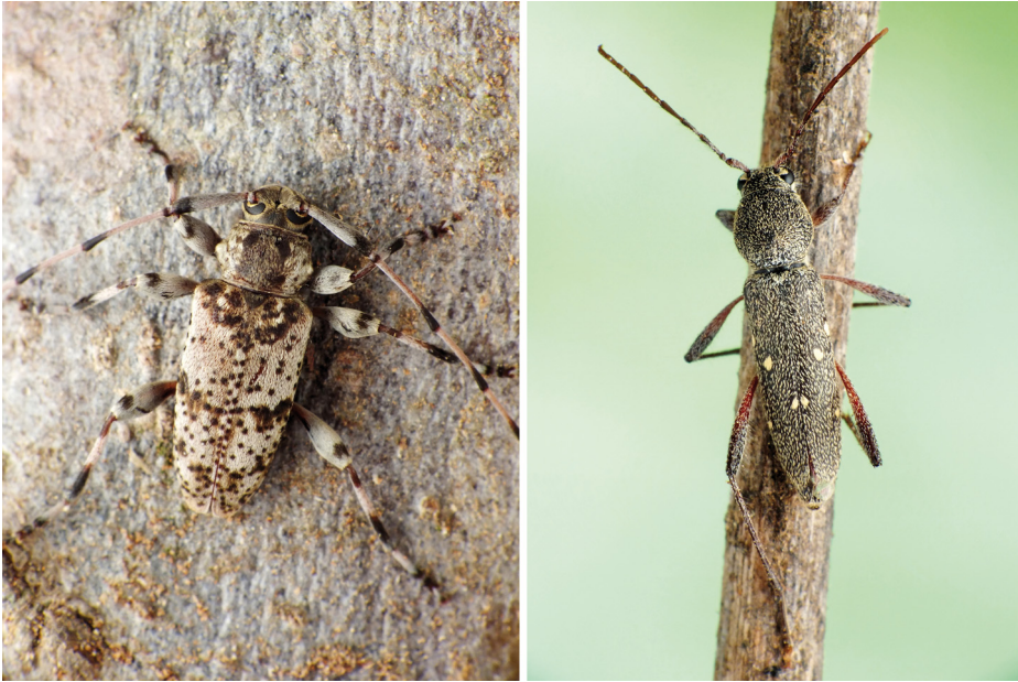
Figs 24–25. Live individuals, 24 = Leiopus syriacus syriacus (Ganglbauer, 1884), 25 = Libanoclytus tommasoi Sama, Rapuzzi et Kairouz, 2010