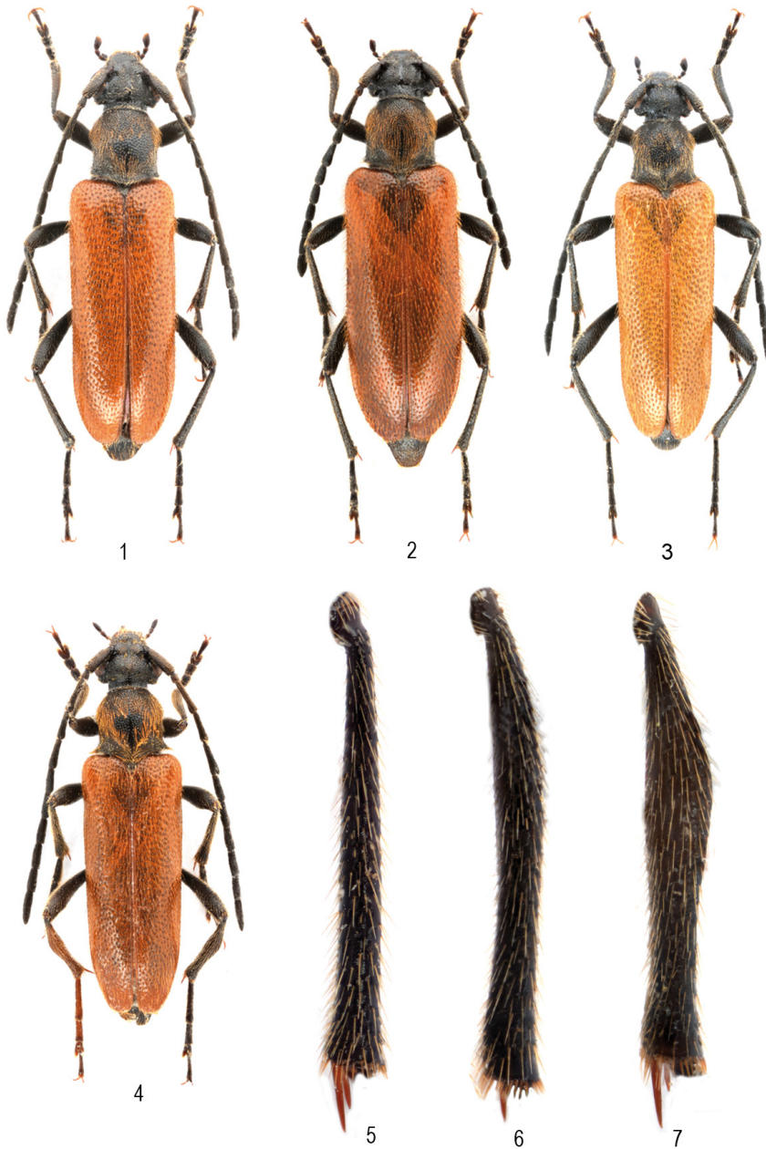
Figs 1–4. Alosterna species, dorsal view: 1 = A. libani sp. n., holotype, male, 2 = A. libani sp. n., paratype, female, 3 = A. pauli Pesarini, Rapuzzi et Sabbadini, 2004, male, 4 = A. anatolica Adlbauer, 1992, male. – Figs 5–7. Tibia of Alosterna species: 5 = A. libani sp. n., 6 = A. pauli , 7 = A. anatolica . Not to scale