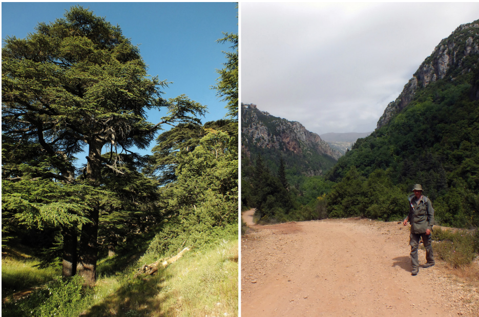
Figs 26–27. Collecting sites, 26 = Horsh Arz el-Rab, ancient Cedrus libani forest, 27 = Quadisha Valley