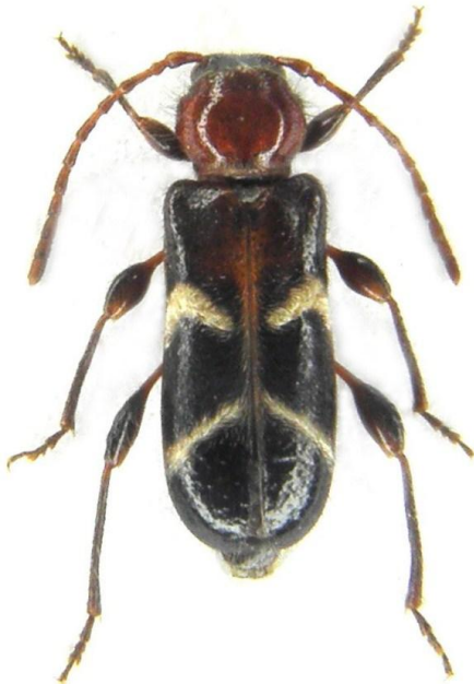
Figure 2. Poecilium antonini n.sp.. Paratype female.